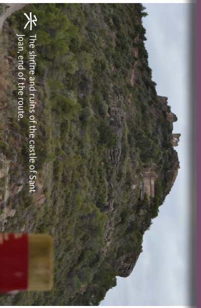
The shrine and ruins of the castle of Sant Joan, end of the route.